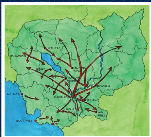
Main routes of forced evacuation of cities and towns by Democratic Kampuchea

Sept 2011 © Narrowcasters & Associates Co., Ltd.